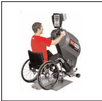
Left: Wheelchair user using a hand cycle-type ergometer