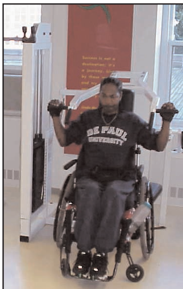
Left and right: A wheelchair user can access this strength training equipment, without transferring, because the seat swings out of the way.