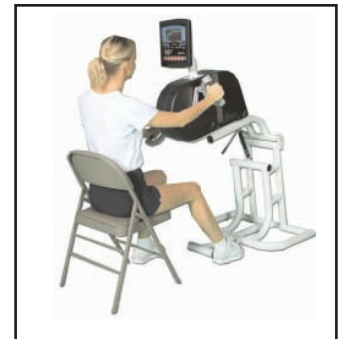
Right: Woman seated in a chair using a hand cycle-type ergometer