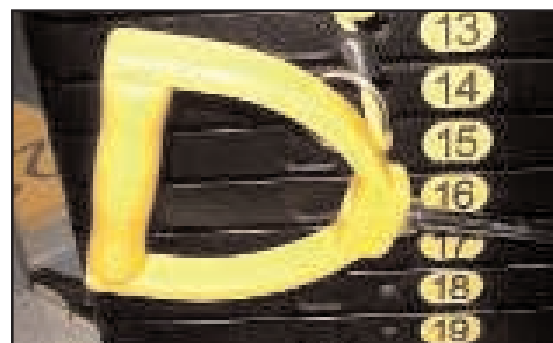
Right: A weight pin grip is large and open. The weight number labels are large, raised, and yellow (high contrast)