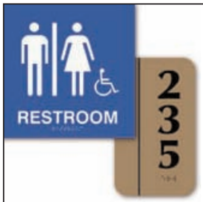
Left: Permanent accessible tactile signs