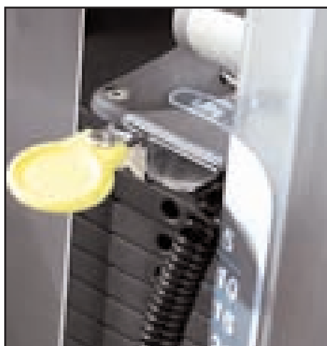
Left: A weight adjustment pin that is large, flat, round, and yellow