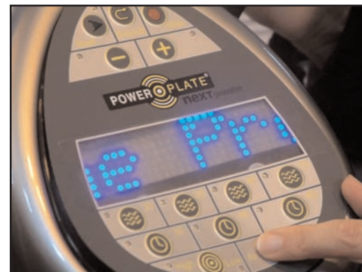
Right: An input console has tactile indicators to help users program exercise bicycles, steppers, treadmills, etc. The display uses large print.