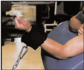
A cuff attached to a person’s arm and to a pulley weight machine