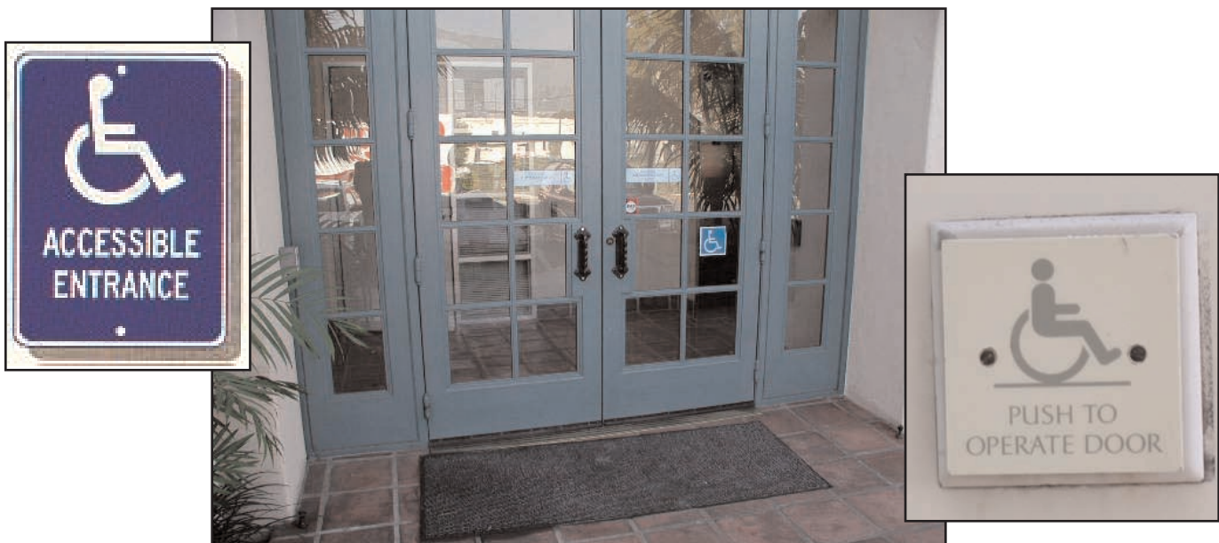
An accessible-entrance; the pushbutton next to the door reads, “Push to Operate Door” and activates a power-assisted door opener